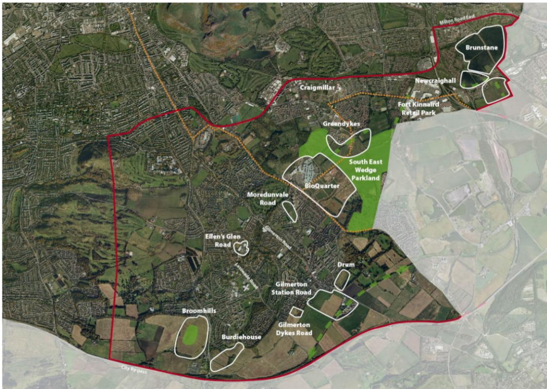
Figure 14 South East Edinburgh overview diagram

South East Edinburgh overview is as follows:-